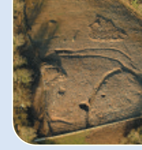
Aerial view of the Fort Hill motte

The medieval period was represented by a motte and bailey fort. Located on Fort Hill, the motte consisted of a series of 14th-century defensive earthworks. These earthworks consisted of an inner 'motte' defined by a very deep V-shaped ditch containing a circular building, possibly a tower and a huge 'post-hole', possibly a beacon socket. The 'bailey' area was roughly rectangular, containing an internal partition and a probable cesspit. Fort Hill ties in with the unrest of the Bruce Invasions, where attacks came down through the Gap in the North from AD 1315, culminating in the nearby Battle of Faughart, where Edward Bruce was killed, in AD 1318.