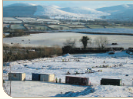
Early medieval enclosed settlement uncovered at Balriggan.

Archaeological investigations were carried out on the MI Dundalk Western Bypass from 2002-2005.