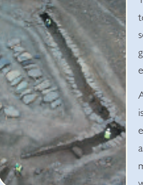
Detail of the Tateetra souterrain northern galleries. Note the large passage size and the (removed)

To the north of the entrance chamber, the passage broadened and deepened to 1.5m wide and 1.7m high. At a right angle at the end of this passage was a second gallery, entered through a door supported on massive, squared, granite jambs and braced by an internal pair of cross beams. A large airshaft emerged from the end of this gallery.